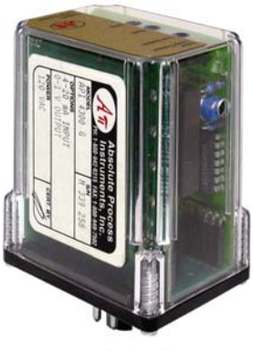
API 4300 G D DC to DC Isolated Transmitter

Solution: API designed a modified version of one of their existing DC voltage converters to be compatible with the input to the engine controller.